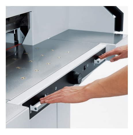
PATENTED EASY-CUT ACTIVATING BARS

Ideal for manual backgauge positioning, the electronic hand wheel has infinitely variable speed control from very slow to very fast.