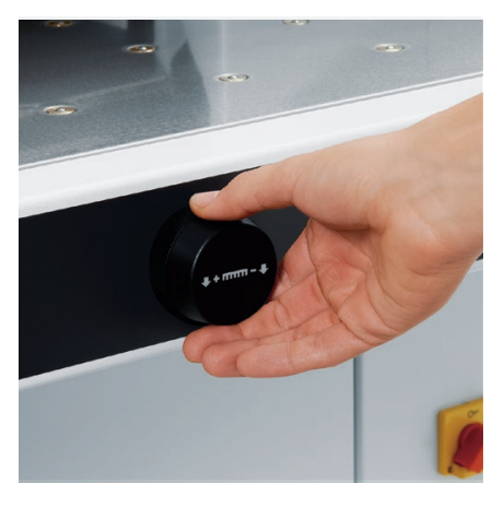
ELECTRONIC HAND WHEEL

The light beam safety curtain in the working area of this professional guillotine ensures the highest level of safety and cutting convenience.