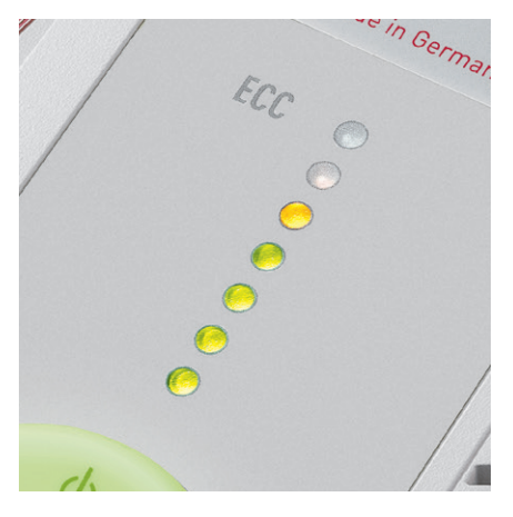
ECC - ELECTRONIC CAPACITY CONTROL This electronic feature indicates the used sheet capacity during shredding process to avoid paper jams.

Ease of operation: intelligent multifunction switch element with integrated optical signals indicating the operational status. Additional "emergency switch" function.